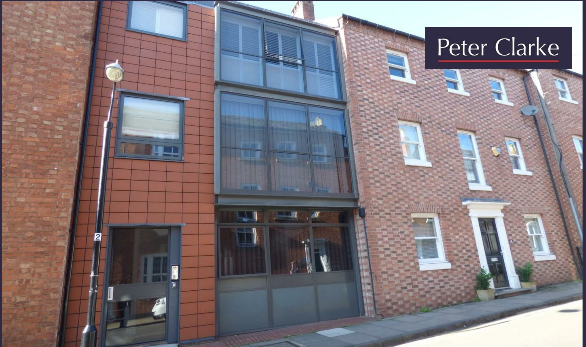
Apartment 1, The Glass House John Street, Stratford-upon-Avon, Warwickshire, CV37 6UB